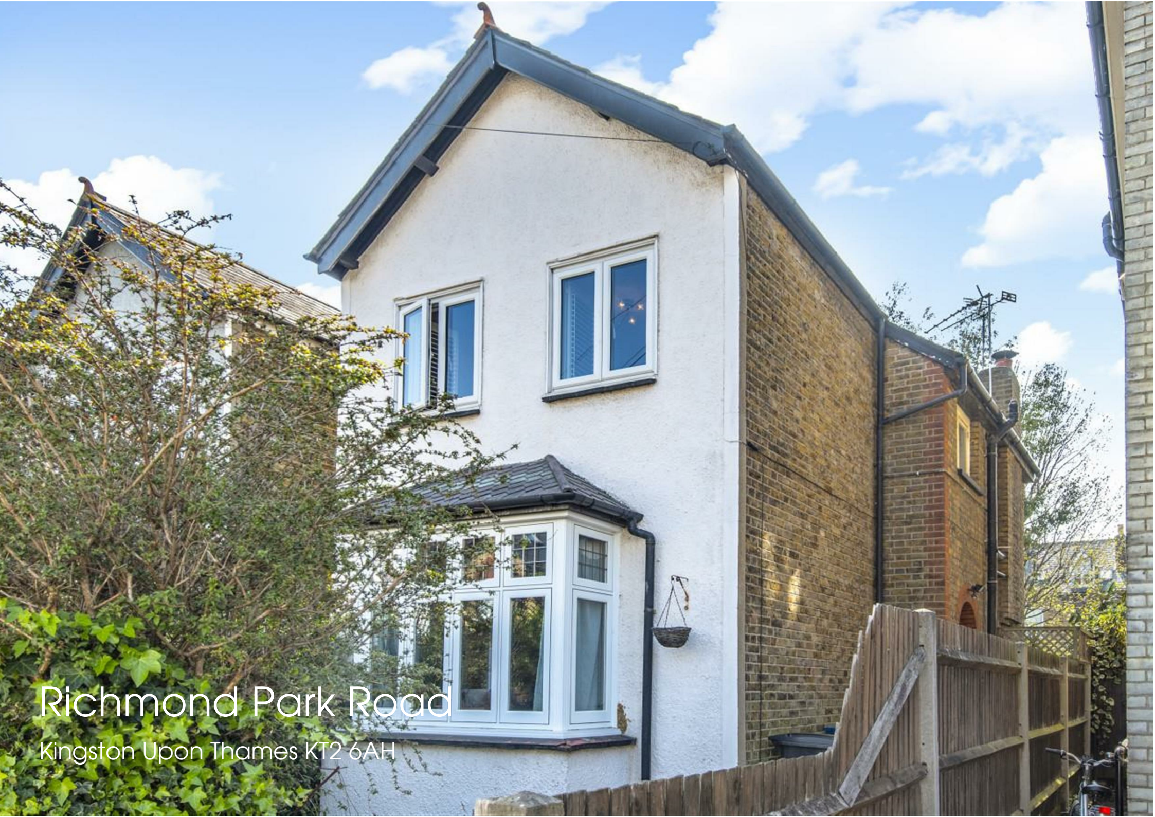
Richmond Park Road Kingston Upon Thames KT2 6AH

34 Richmond Road Kingston upon Thames Surrey KT2 6ED www.gibsonlane.co.uk Tel: 020 8546 5444